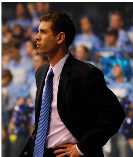
Butler University Coach Brad Stevens is also set to speak at All-Star Sports Week.