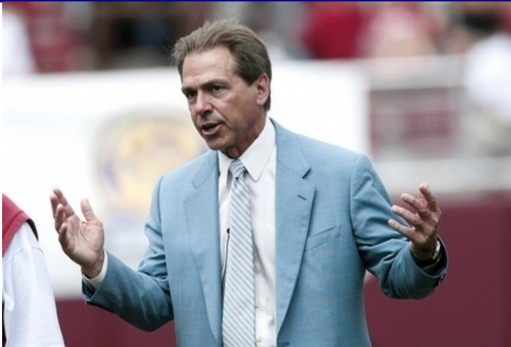
Alabama head football coach Nick Saban will speak to state's coaches at All-Star Sports Week in July.

For the second straight year, the Alabama High School Athletic Directors and Coaches Association has secured the NCAA's defending national championship football coach as its keynote speaker for All-Star Sports Week set for July 12-16 at Huntsville's Von Braun Center.