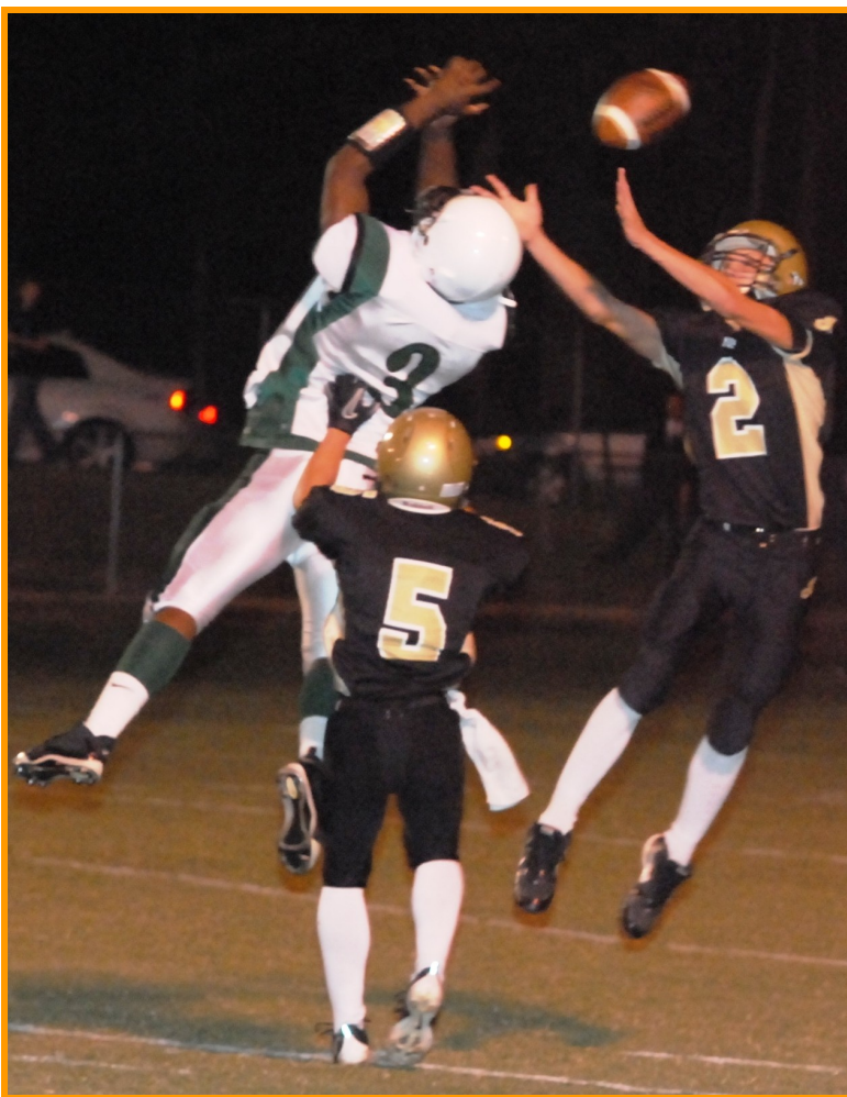
Isabella Mustangs defenders (above) break up a pass intended for a Central-Hayneville receiver at last week’s contest played at Isabella.